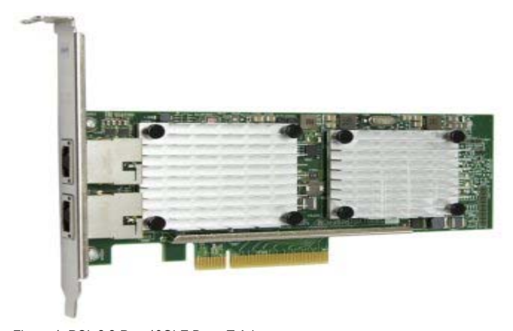
Figure 1. PCle2 2-Port 10GbE Base-T Adapter

This IBM® Redbooks® Product Guide describes the PCle2 2-Port 10GbE Base-T Adapter and PCle2 4-Port (10GbE SFP+ & 1GbE RJ45) Adapter products. These are PCl Express Generation 2 (PCle2) x8, short form-factor, low-profile capable, regular height network interface card (NIC) adapters. The 2-port adapters enable affordable 10-Gigabit Ethernet (10GbE) network performance with cost-effective RJ45 connections for distances up to 100 meters. The 4-port adapter enables affordable 10-Gigabit Ethernet (10GbE) network performance over SFP+ Multimode Fiber SR optical modules and also supports SFP+ Active Copper cables, depending on the Ethernet switch used. They are compatible with the installed base of GbE switching and cabling infrastructure commonly deployed today.