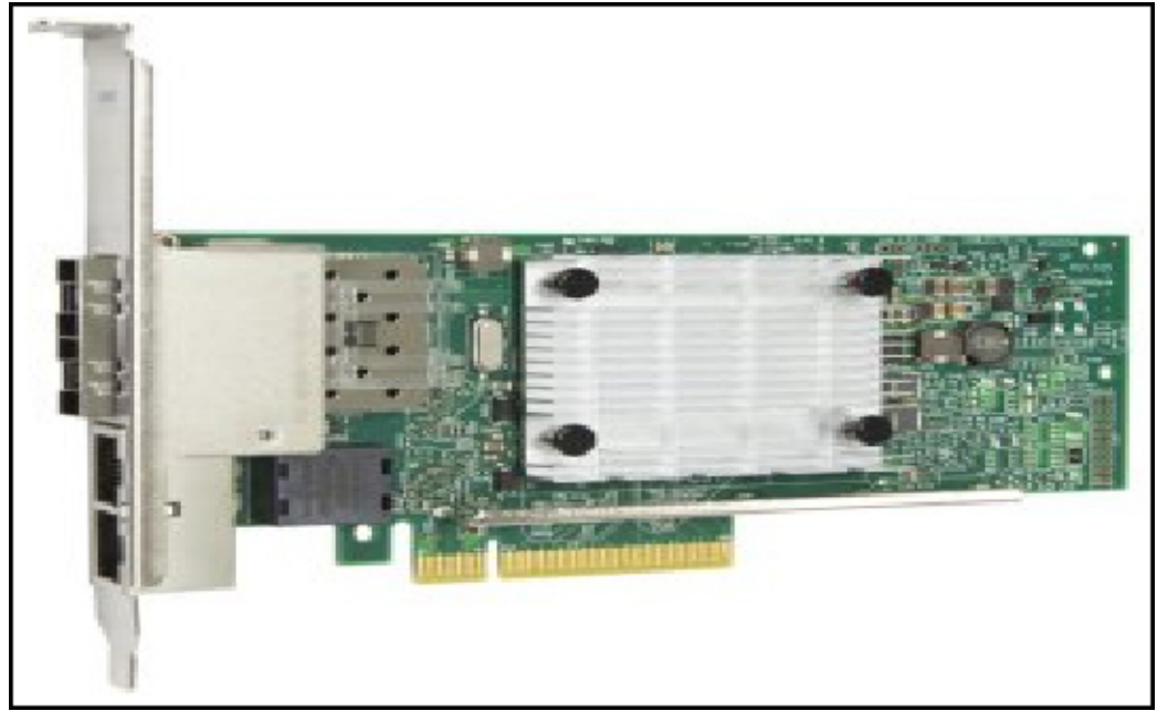
Figure 2. PCle2 4-Port (10GbE SFP+ & 1GbE RJ45) Adapter